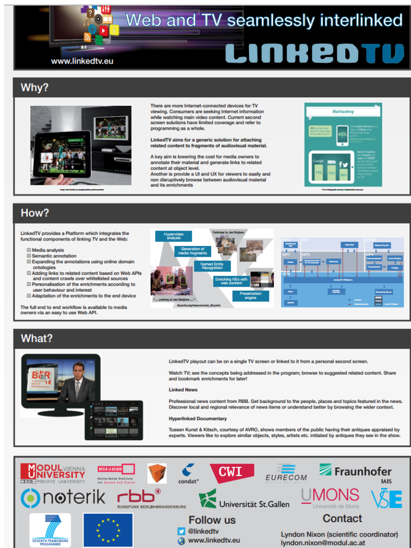
Figure 3: The LinkedTV Poster